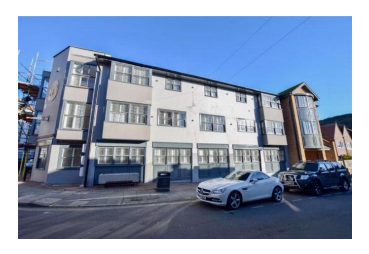
2 BEDROOM FLAT - HIGH STREET