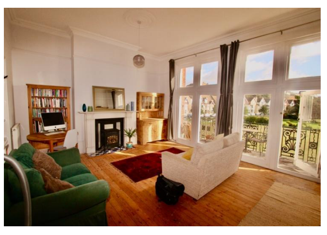
1 BEDROOM FLAT - GROSVENOR GDNS