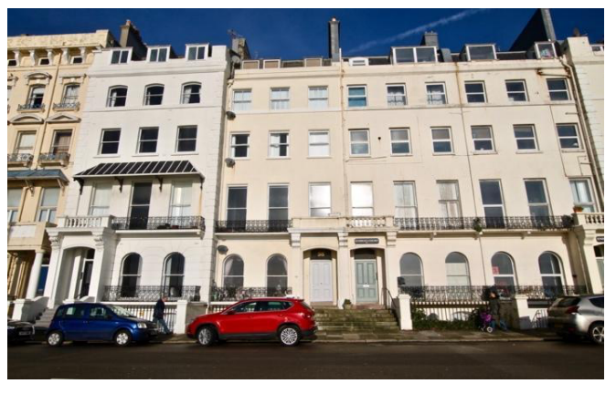
1 BEDROOM FLAT - MARINA