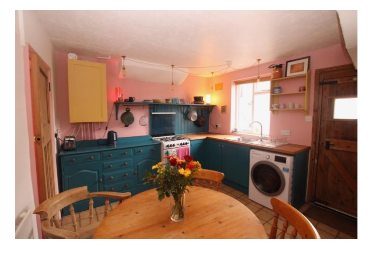
2 BEDROOM HOUSE - TACKLEWAY