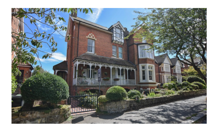
2 BEDROOM FLAT - PEVENSEY ROAD