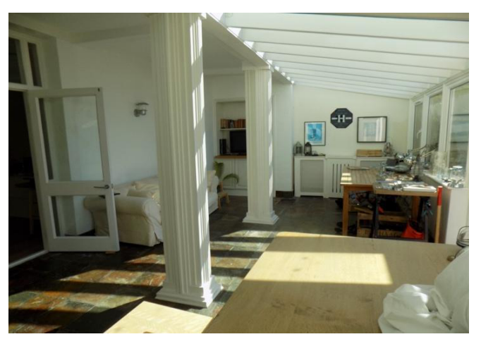
2 BEDROOM & GARDEN - WEST HILL RD